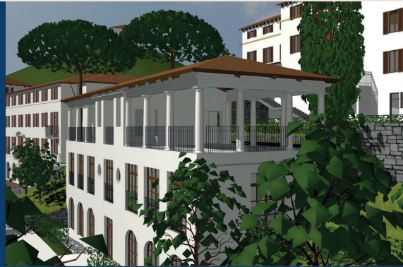
B. LA LIMONAI A CLASSROOMS