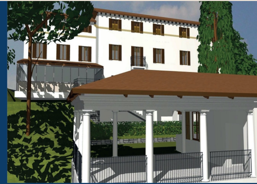
C. BELVEDERE ELEMENTARY SCHOOL CENTER