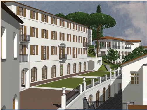
A. THE DONALD MACDERMID CENTER (MUSIC, ACADEMICS, RESIDENCE)