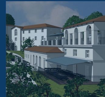
D. DINING HALL WITH POOL BEHIND