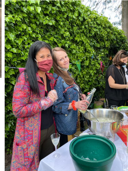
Hiding Easter Eggs in the middle of the night